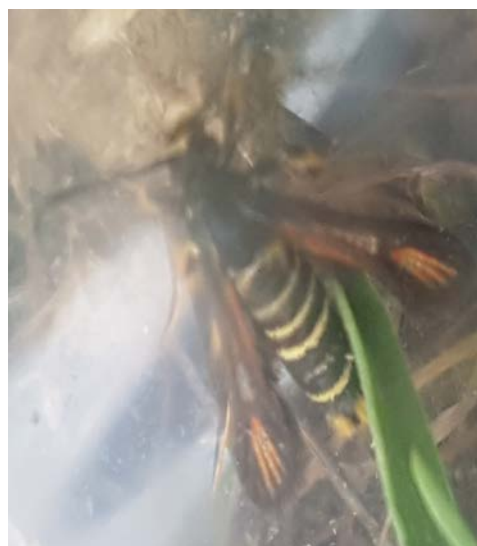
Six-belted Clearwing (Kevin Hewitt)