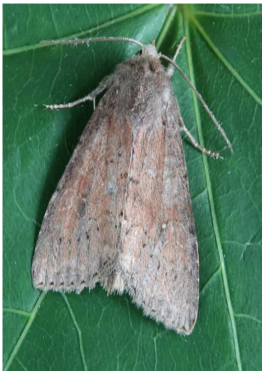
Suspected (Parastichtis suspecta) (Hazel Mitchell)