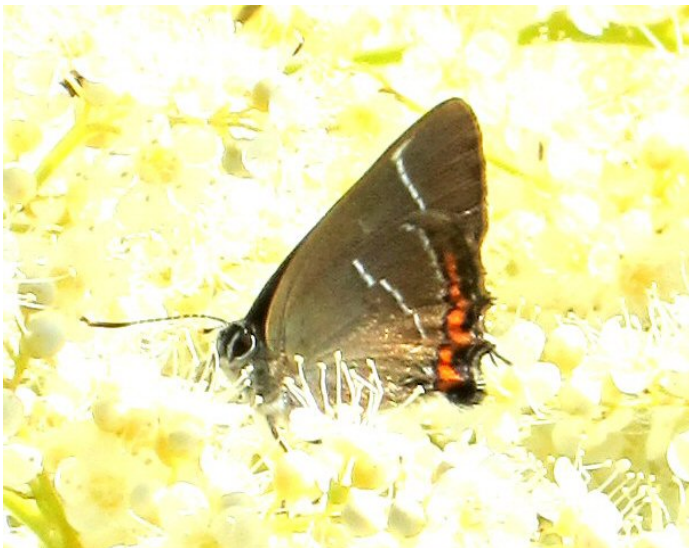
White Letter Hairstreak (Simon Phipps)