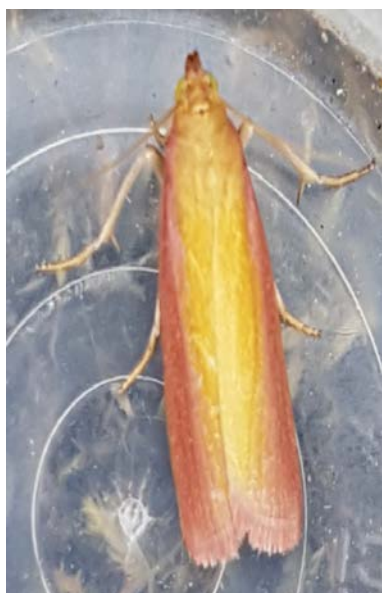
Oncocera semirubella (Kevin Hewitt)