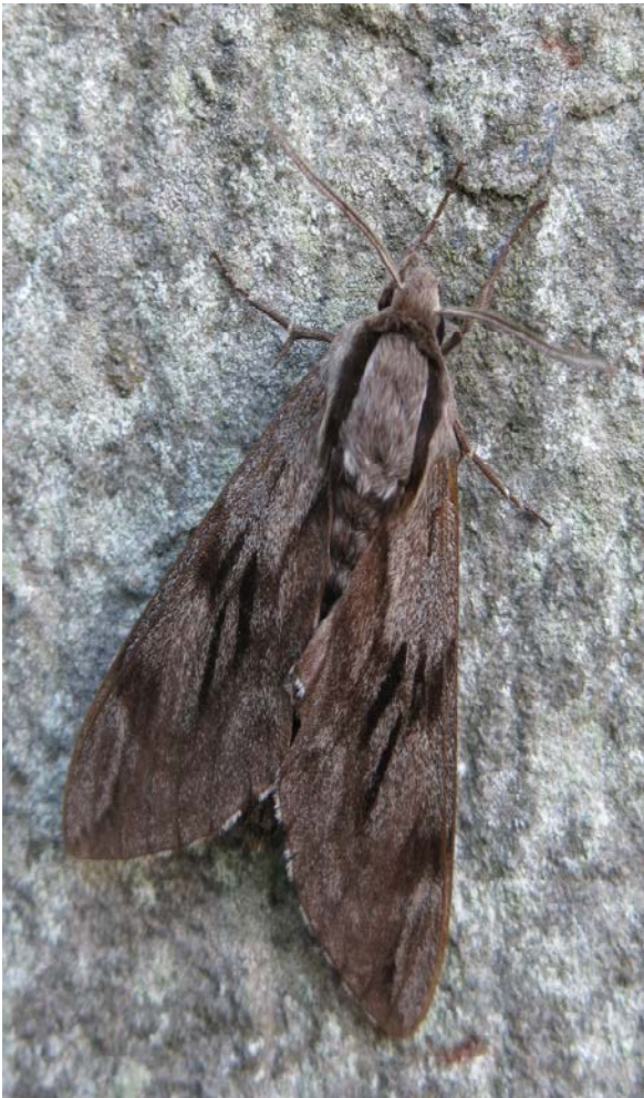
Pine Hawk (Sphinx pinastri)