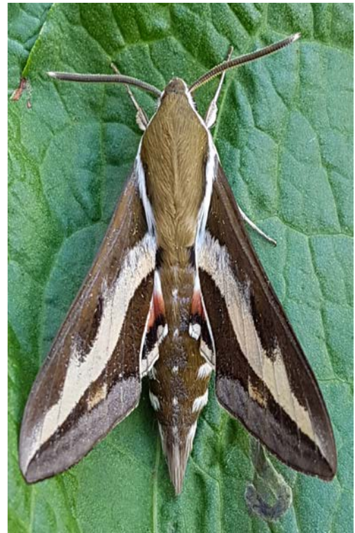
Bedstraw Hawk (Hyles gallii)

The addition of Pine Hawk brings the VC35 macromoth list to 585 species.