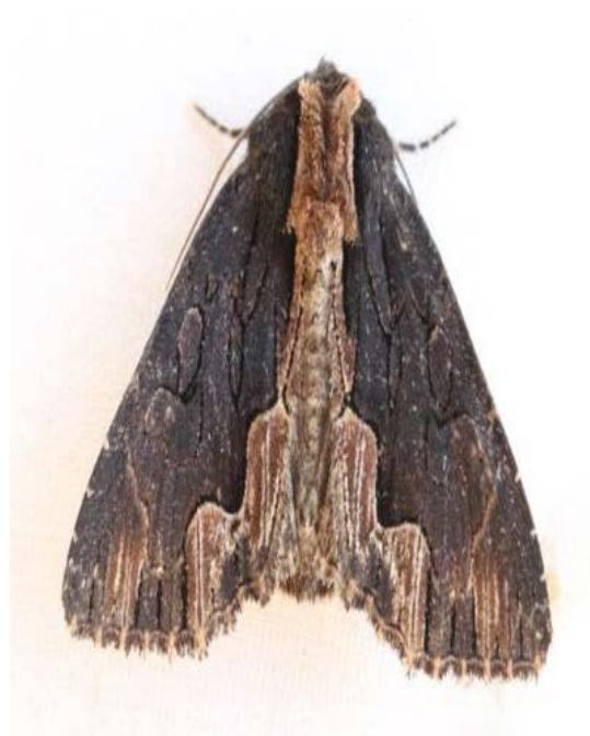
Bird's Wing (Dypterygia scabriuscula)