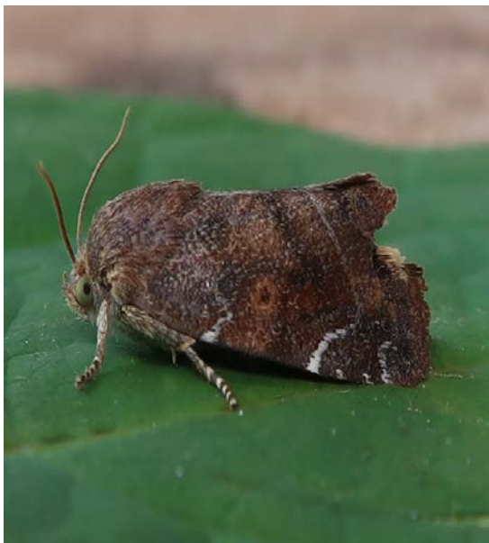
Lesser-spotted Pinion (Hazel Mitchell)

17 th Aug Lesser-spotted Pinion to light at Tintern. Much less common than its close relative, the Lunar-spotted Pinion (Hazel Mitchell)