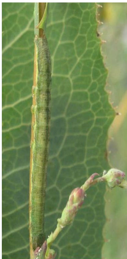
Small Ranunculus larva on prickly lettuce