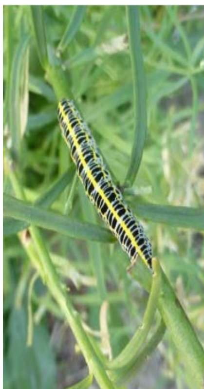
Toadflax Brocade larva