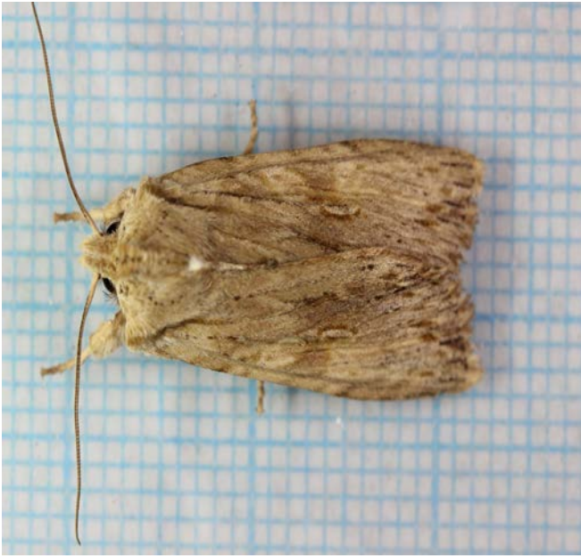
Pale Pinion (Christine Knights)