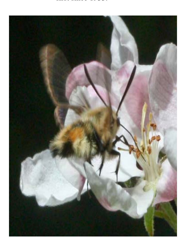
Narrow-bordered Bee Hawk