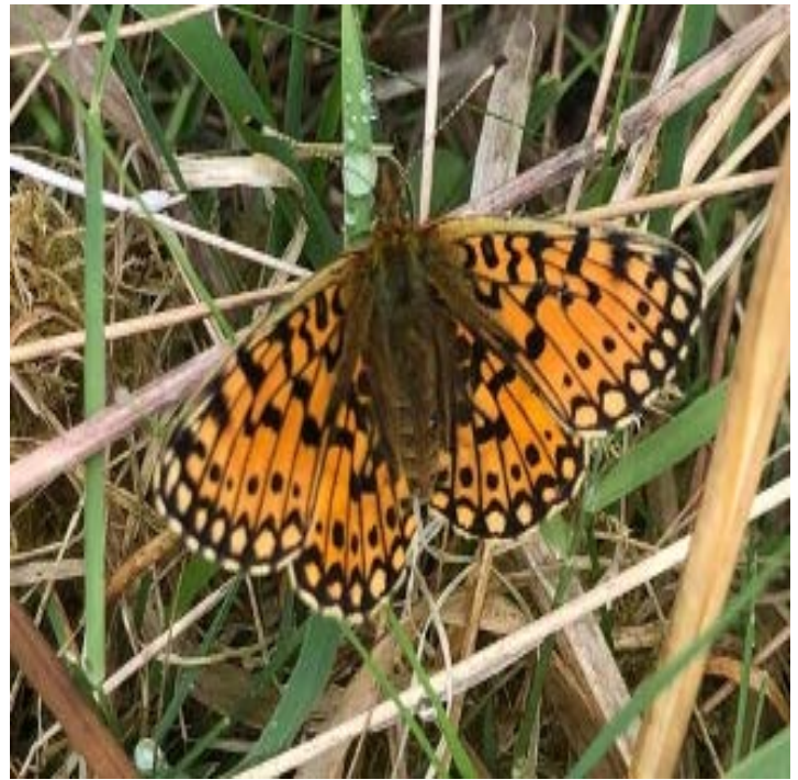
Small Pearl-bordered Fritillary (Kevin Dupé)