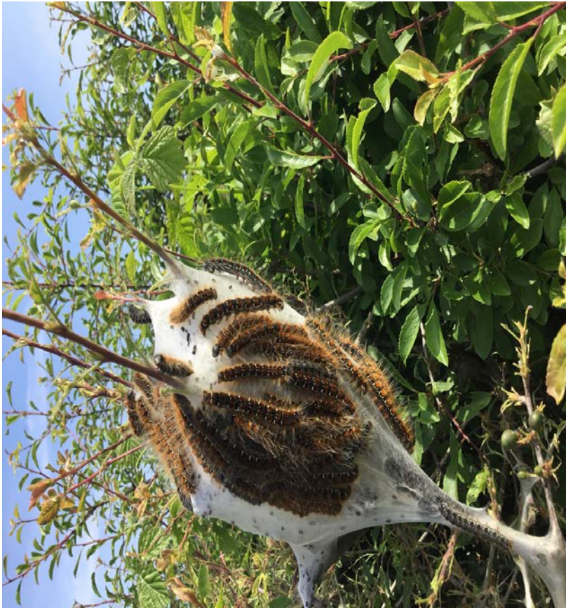
Small Eggar larval web