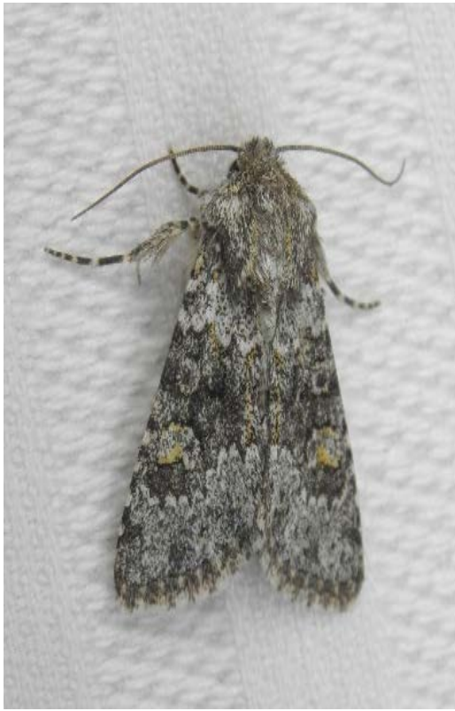
Small Ranunculus (Nick Felstead)