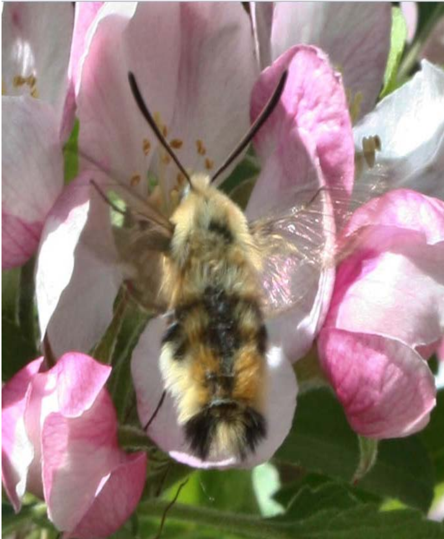
Narrow-bordered Bee Hawk

https://www.youtube.com/watch?v=oGj0wYhkbj8