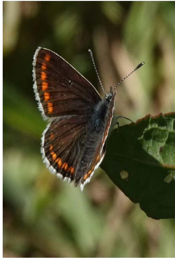
Brown Argus