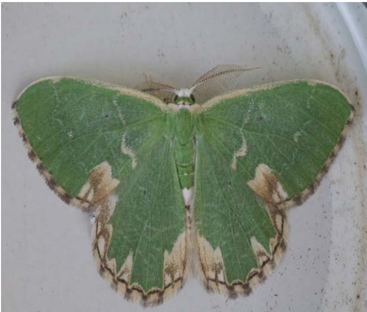
Blotched Emerald (Wendy Tyler-Batt)