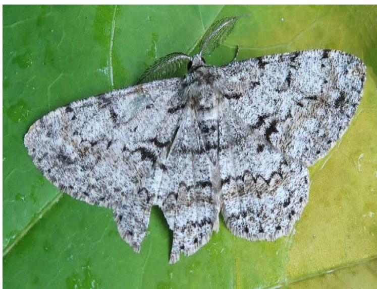
Great Oak Beauty (Hazel Mitchell)