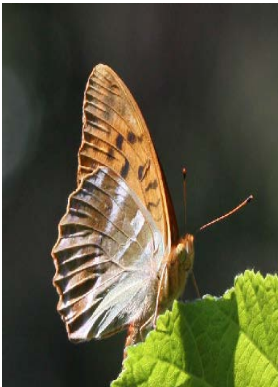
Silver-washed Fritillary (Rupert Perkins)