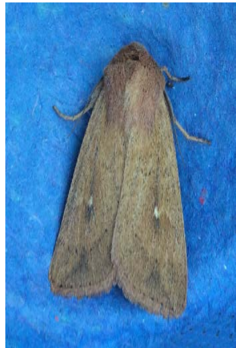
White-speck (Arthur Pitcher)