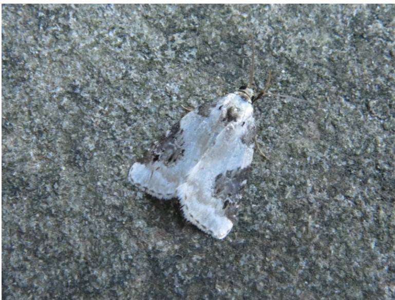
Shining Marbled ( Pseudeustrotia candidula )