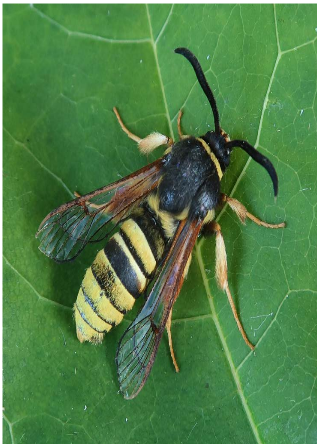
Lunar Hornet Moth (Hazel Mitchell)

2 Lunar Hornet Moths to a pheromone trap at Tintern. Two further individuals were attracted the following day. A moth is just visible on the right edge of the yellow trap below (Anglian Lepidopterist Supplies Ltd). 8 th to 11 th Gwent records. (Hazel Mitchell)