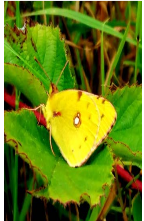
Clouded Yellow (Ian Rabjohns)