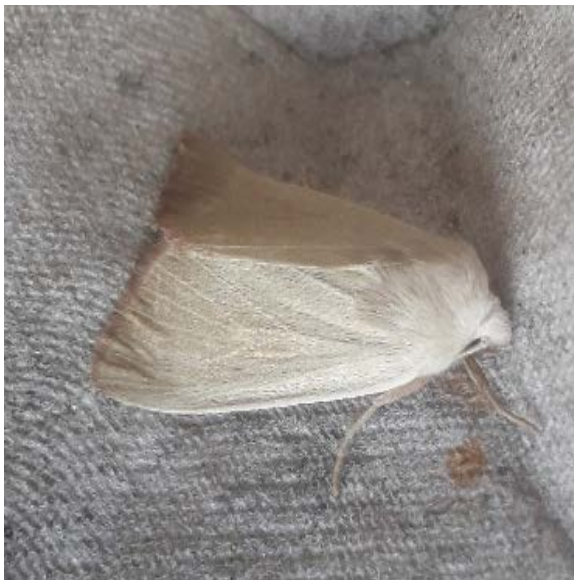
Fen Wainscot ( Arenostola phragmitidis ) (Kevin Dupé)

Kevin Dupé had a specimen of this reed-feeder come to light at Newport Wetlands NNR on 16 th July. It is mainly a species of eastern England, but a colony was found in west Glamorgan (Crymlyn Bog) over twenty years ago. It is also known from north Somerset. Given the abundance of the foodplant, it was probably only a matter of time before Fen Wainscot found its way to Newport Wetlands.