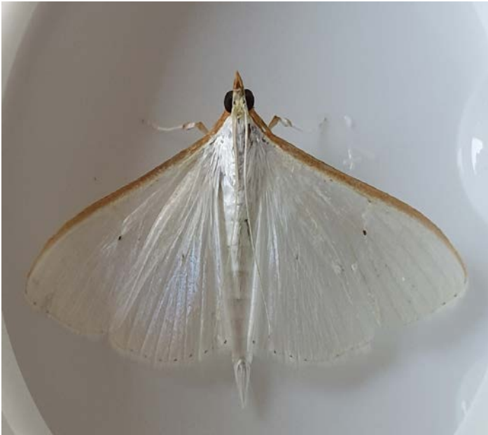
Palpita vitrealis (Kevin Hewitt)