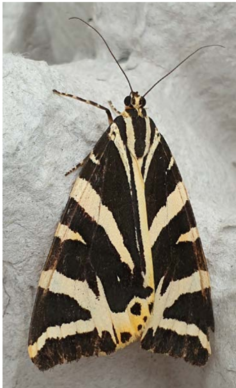
Jersey Tiger

Notable among resident species was Jersey Tiger. It first occurred in Gwent in 2011, but this year sixteen individuals have been recorded between 26 th July and 17 th August. It is well established in the south of Gwent, to such an extent that it is more common than Garden Tiger (7 records), though way behind Scarlet Tiger (48 records)