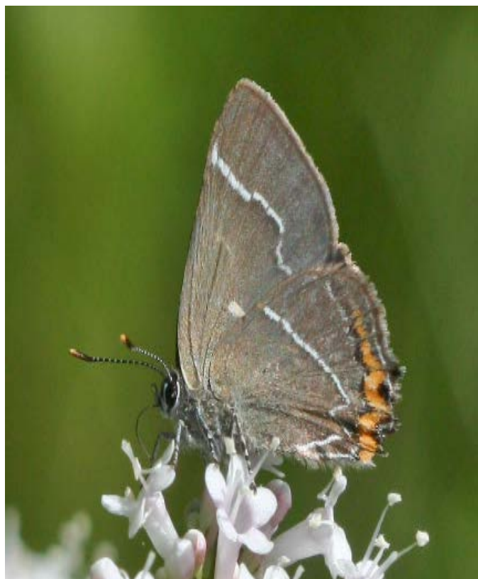
White Letter Hairstreak (Rupert Perkins)