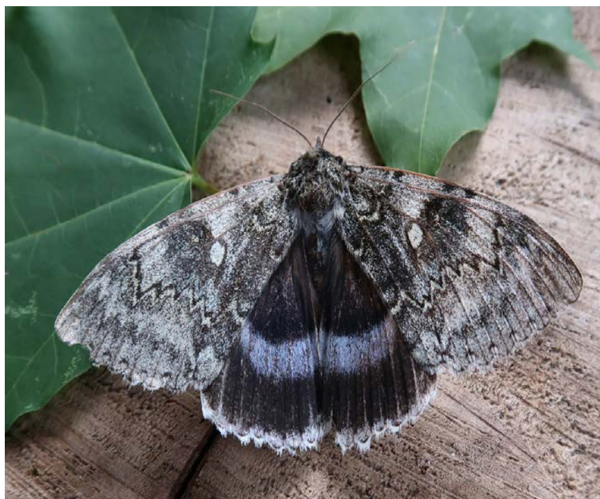
Clifden Nonpareil and the distribution of Gwent records 2018-2020