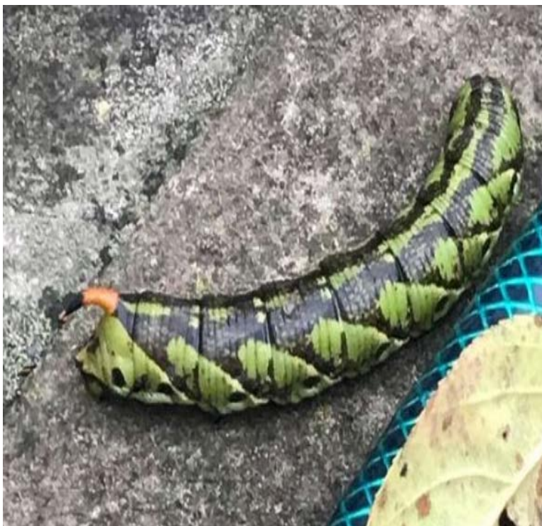
Convolvulus Hawk Caterpillar (Shona Woodbridge)