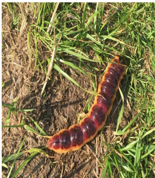
Goat Moth larva (per K Jones)