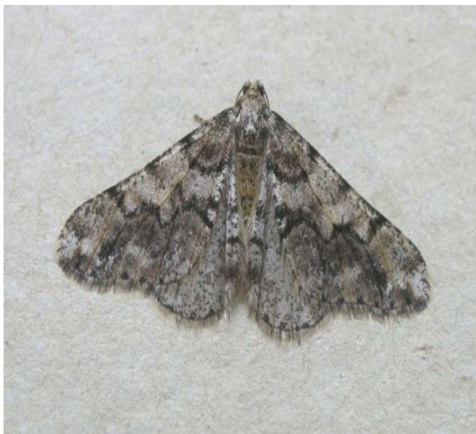
Spring Usher (light form)