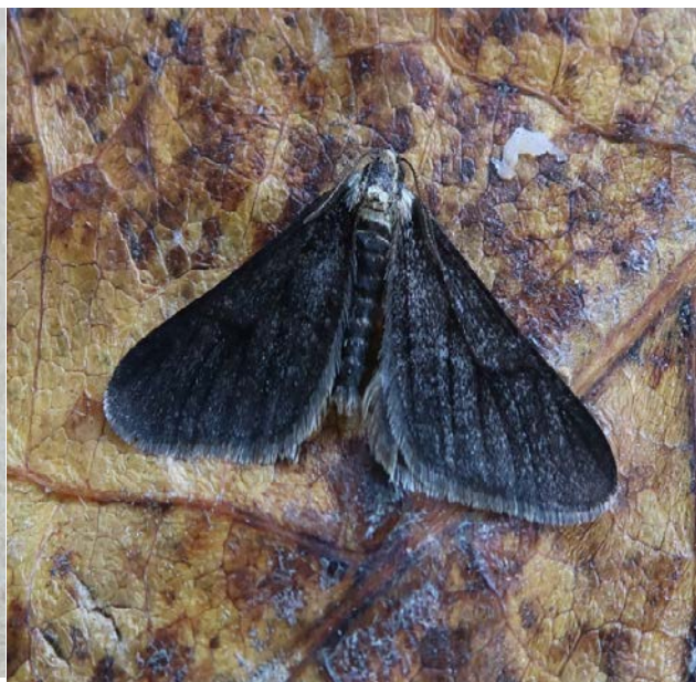
Spring Usher (black form) (Hazel Mitchell)