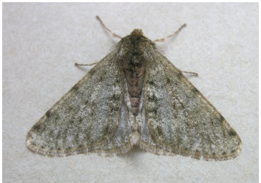
Pale Brindled Beauty