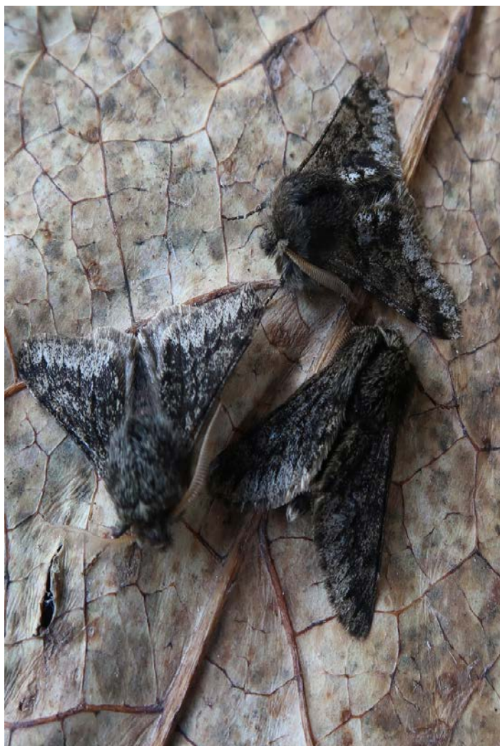
Small Brindled Beauties (Hazel Mitchell)

15 th Feb 129 moths to light at Tintern including 89 Spring Usher, 15 Pale Brindled Beauty, 2 March Moth, 1 Satellite, 1 Small Quaker, 5 Chestnut, 3 Dotted Border and 3 Small Brindled Beauty. The first of a record total of 13 Small Brindled Beauty during February. (Hazel Mitchell)