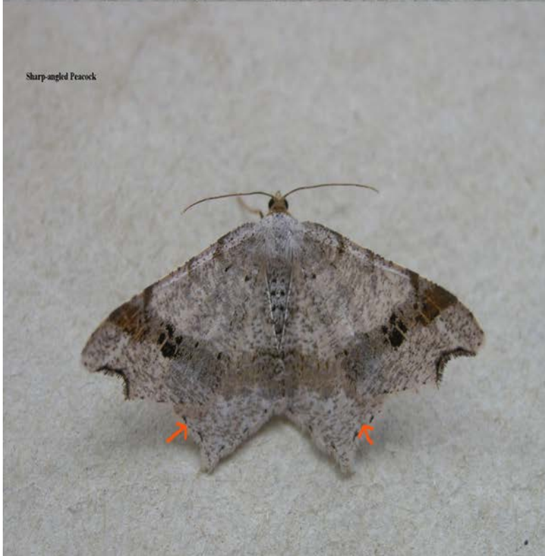
Sharp-angled Peacock Moth