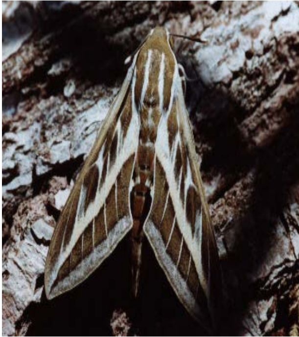
Striped Hawk (previous specimen)