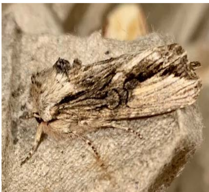
Silver Cloud (Wendy Tyler-Batt)