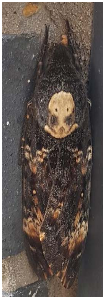
Death's Head Hawk-moth